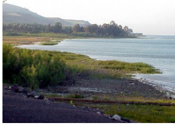
View of the Sea of Galilee