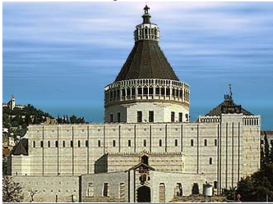
Church of Annunciation, Nazareth