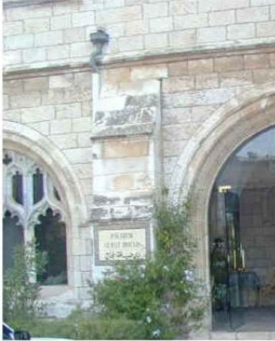
Saint George's Pilgrim Hospice in East Jerusalem